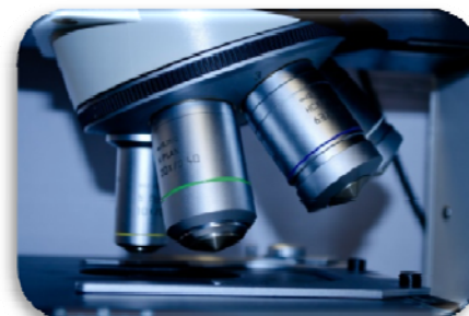
Bio / Medtech