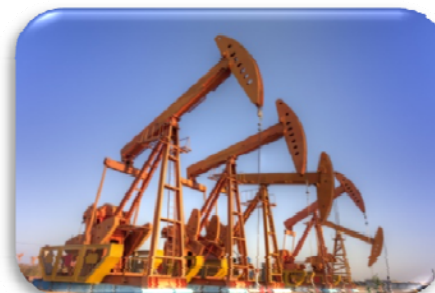
Oil & Gas / Energy