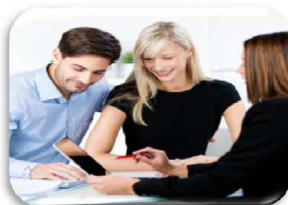
Financial / Professional Services