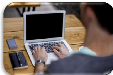
IT / Telecom